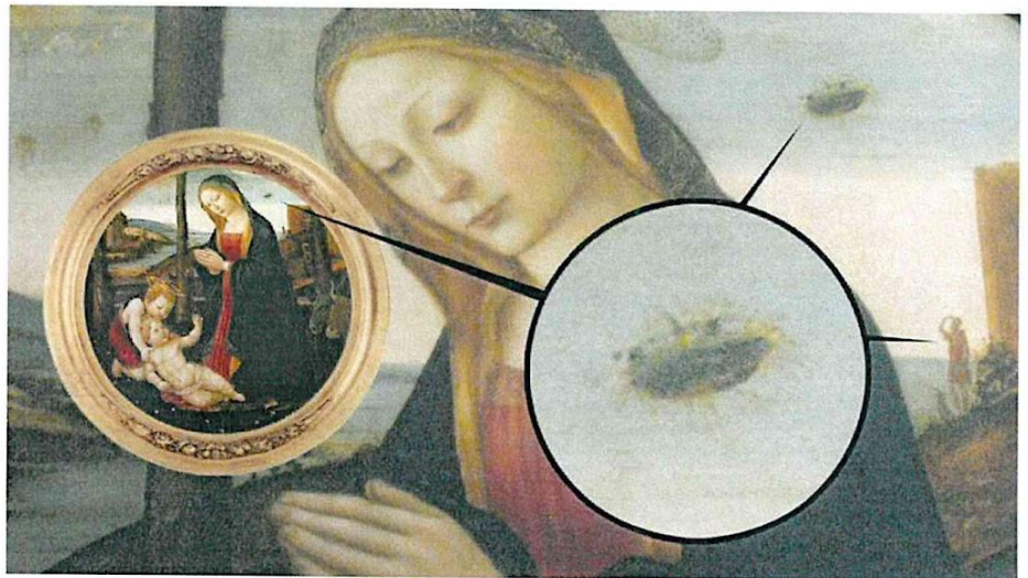
The Madonna with Saint Giovannino. Some believe that there is a depiction of an alien spacecraft, or UFO, in the background of the painting.

The Madonna with Saint Giovannino , a painting from 15th century Italy, shows the Virgin Mary with a man looking up at an uncanny depiction of a flying saucer. Were these ancient artists just using their imaginations like we do when we make alien movies? Certainly our ancient ancestors were capable of contriving to